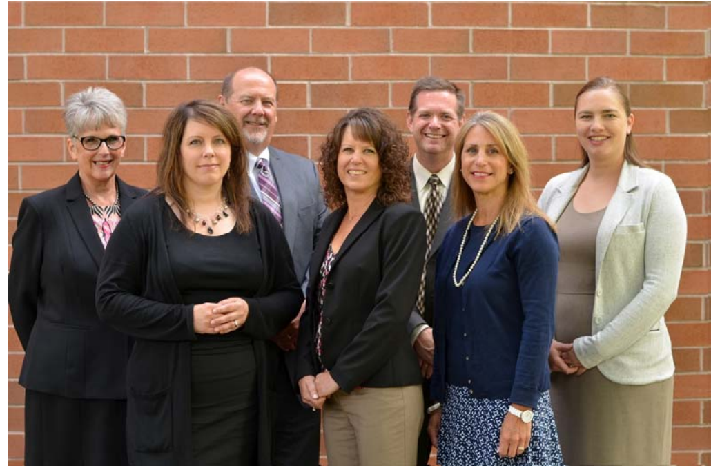
Pictured above: CIS Pre-Loss and Hire to Retire (H 2 R) staff